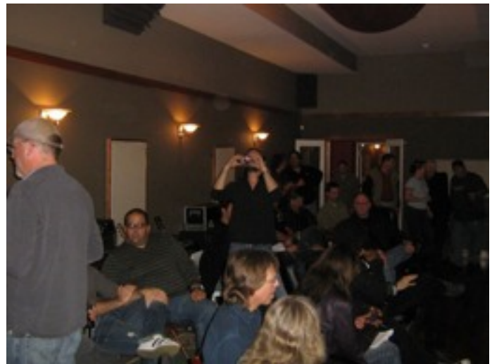
A packed house!